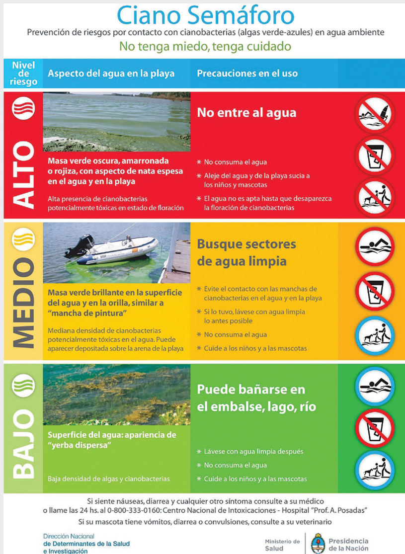
Figure 2 "Cyanosemaphore" with three levels of water quality and corresponding advice for water use.