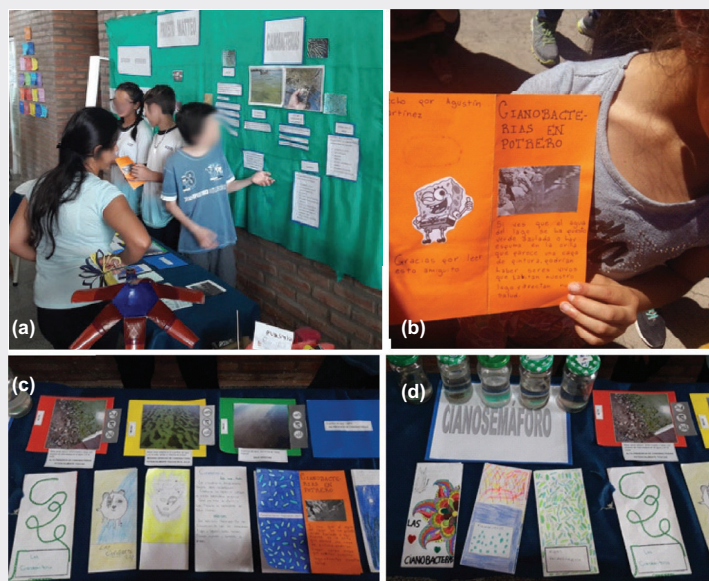
Figure 3 (a) Stand at the annual school fair, (b) brochure by sixth grade students, (c and d) explanation and visualisation of the different alert levels of the “cyanosemaphore”.

The students act as multipliers of knowledge in their homes and in the community, particularly for communicating bloom alarms. They exhibited information at their stand at the annual school fair where they handed out a brochure they had developed to explain what cyanobacteria are, how they affect health, what precautions to take, as well as the meaning of the different alert levels of the “cyanosemaphore” (Figure 3).