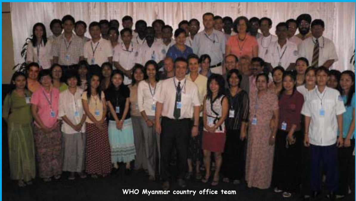
WHO Myanmar country office team

Firstly , upgrading significantly the WHO country presence, and increasing the number of competent WHO technical staff working in-country, has allowed us to support new health systems initiatives, in addition to the traditional vertical programmes. Examples include: (1) preparing the groundwork for the possible establishment of a school of public health in the country , (2) stimulating the development of national health accounts , (3) including the country in the world health survey , and (4) supporting the Ministry of Health's management effectiveness programme .