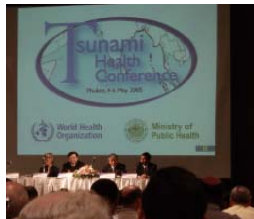
Tsunami health conference in Phuket, Thailand