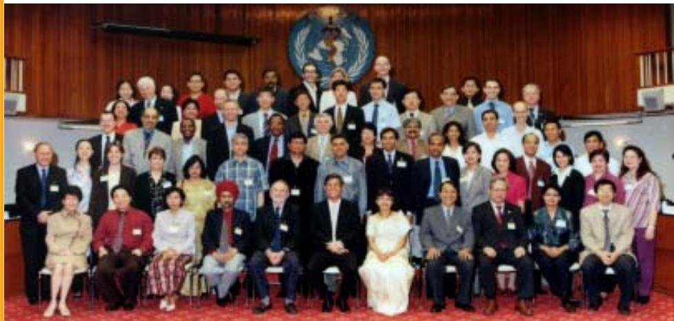
Members of the subgroup on public private mix meet to deliberate the DOTS expansion,

WHO WPRO, Manila, the Philippines, 4-6 April 2005