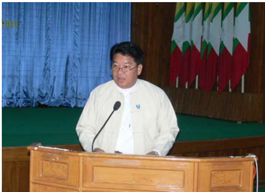
Union Minister for Health, H.E. Prof Pe Thet Khin delivering the opening speech.

T he multi-sectoral meeting on Non Communicable Diseases (NCDs) was conducted at the meeting hall of the Ministry of Health in Nay Pyi Taw on 5 August 2011.