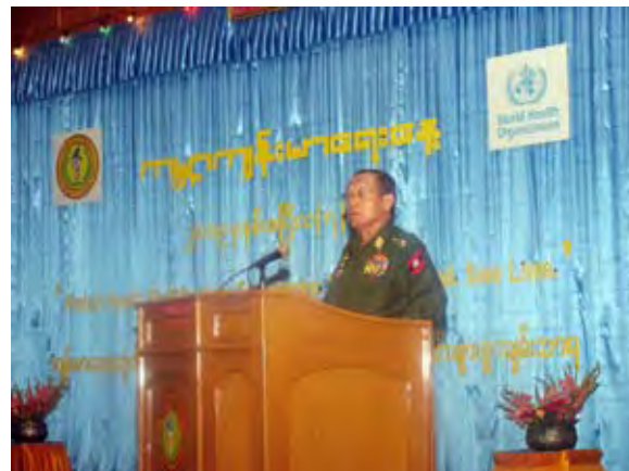
Secretary-1 General Thiha Thura Tin Aung Myint Oo makes a speech at the World Health Day 2009 commemoration ceremony at Nay Pyi Taw.

WHO Myanmar also produced grey and red advocacy bags and red colour mugs with World Health Day 2009 and WHO Country Office Myanmar logo which were distributed at the ceremony on the morning of World Health Day at the meeting hall in Nay Pyi Taw. A WHO fact sheet on "Protect Health Facilities from Emergencies: Prepare. Respond. Save Lives", in English was especially produced along with the regular WHO Myanmar quarterly newsletter and Director General's