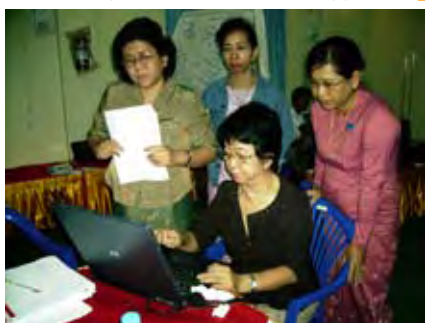
Participants in Group Work for Five-year Strategic Plan (2009-2013)

The Department of Health next called for a final workshop for dissemination of the final draft on 1 and 2 May 2009, inviting the same departments and stakeholders for finalization. A thorough review of the document was made in this workshop. A Technical Working Group was also formed with clear and specific terms of reference. The MCH Unit, Department of Health will finalize the draft and then put up to the Ministry of Health for final approval. ■