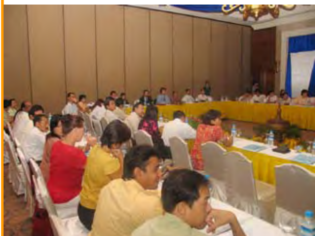
Participants at the dissemination workshop on findings of HIV sentinel serosurveillance survey & behaviour surveillance survey 2007-08, Yangon.

With technical input from WHO and financial support from the 3 Diseases Fund, the National AIDS Programme (NAP) of the Department of Health has substantially improved the HIV surveillance system in recent years. These improvements include the revision of HIV Sero-sentinel surveillance (HSS) protocols as well as the