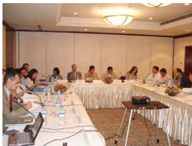
Participants taking part in the Follow-up Partners Meeting at Traders hotel, Yangon.