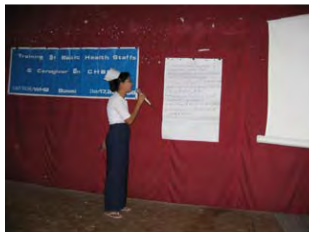
A basic health staff taking part in the training of community home-based care in Dawei.