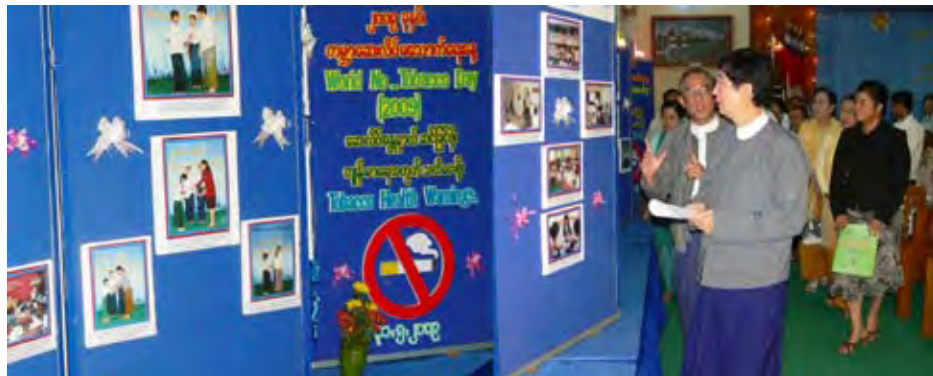
Mini-exhibition featuring tobacco control activities being viewed by the dignitaries and invited guests.

On 31 May 2009, the Ministry of Health, Myanmar, in close collaboration with WHO Country Office, organized the official commemoration ceremony of the World No Tobacco Day 2009 at the conference hall of the Ministry of Health, Nay Pyi Taw. The ceremony was attended by H.E. Minister for Health, Prof Kyaw Myint, H.E. Deputy Minister for Health, Prof Mya Oo, Directors-General and senior officials from the Ministry of Health, Ministry of Education, Ministry of Information, Ministry of Sports