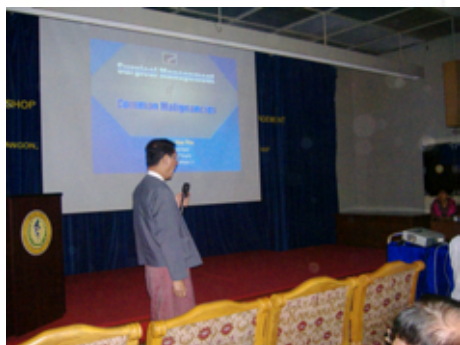
Presentation by Prof Han Win on surgical management of common malignancies.

common cancers namely cervical, breast, lung, ENT and gastrointestinal cancers. The discussion also highlighted on issues relating to prevention and provision of effective medical treatment for cancer patients.