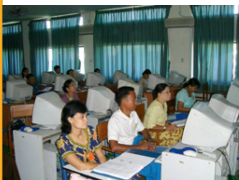
Participants at the HINARI and HELLIS training workshop.

With the support of WHO, the Department of Medical Sciences conducted the HINARI (Health Internetnetwork Access to Research Initiative) and HELLIS (Health Literature, Library and Information Services) training workshop from 25 th June to 29 th June 2007 in Yangon at the Medical Education Centre conference hall. The workshop was targeted to build capacity in HELLIS libraries who have not yet integrated the HINARI into their library services.