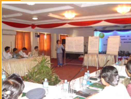
Presentation on low-cost water supply, sanitation and hygiene intervention