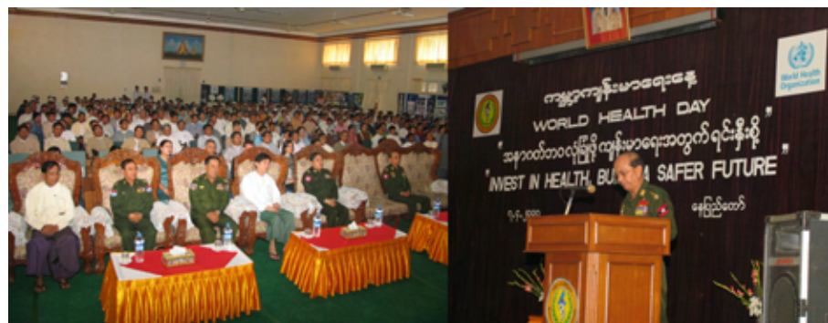
Secretary 1 of the State Peace and Development Council Lt-Gen Thein Sein delivers a speech at the World Health Day 2007 opening ceremony at Nay Pyi Taw.