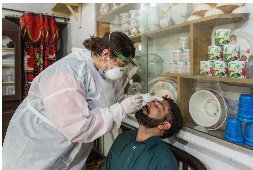
Pakistan's drive to restore essential health services during COVID-19