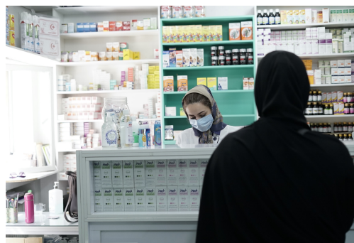
Islamic Republic of Iran tackles COVID-19 by enhancing primary health care