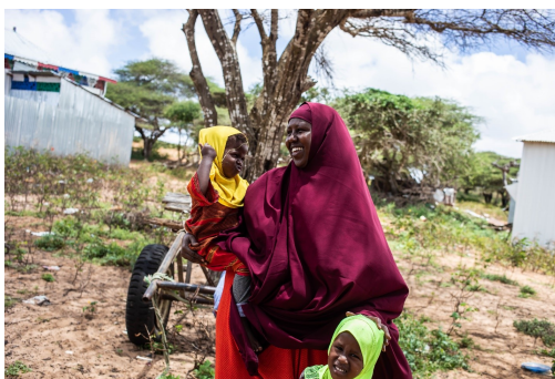
Health for all is Somalia's answer to COVID-19 and future threats to health