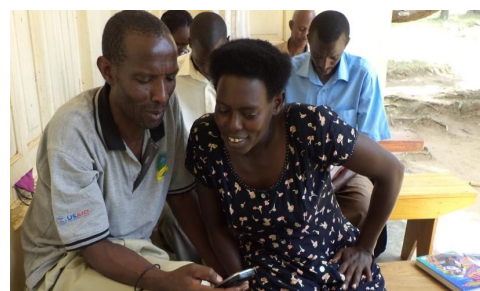
Village health team members mastering the art of using SMS

Pregnant mothers are registered by Village Health Team members who avail the information to the Secretariat through their focal people. Mothers are sent reminders on going for antenatal check-ups and encouraged to deliver their baby at health facilities. In addition, messages also include health rights and responsibilities, health education, feedback and redress mechanisms. The community members are also given a chance to send their thoughts to the platform. Members register according to their districts which helps us to understand the issues arising from a particular district.