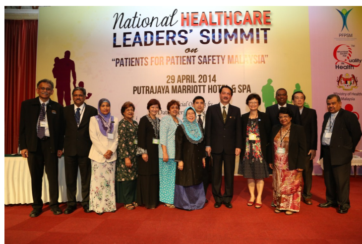
Participants during the PFPS Malaysian Network launch

The launch of PFPSM was graced by the Honorable Minister of Health and its' closing by the Director-General.