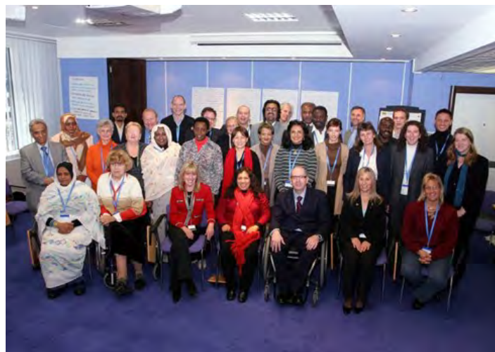
First PFPS Workshop, London, 2005

PFPS is part of the Patient Safety and Quality Improvement (PSQ) administrative structure. In practice, however, we work across teams and departments to promote patient leaderships and bring the patient voice to health care. In the coming months, we will set out a journey to reflect PFPS achievements as a programme, as a network and as patient advocates. I hope you will join us by sharing your experience as patient advocates or PFPS champions. Watch this space!