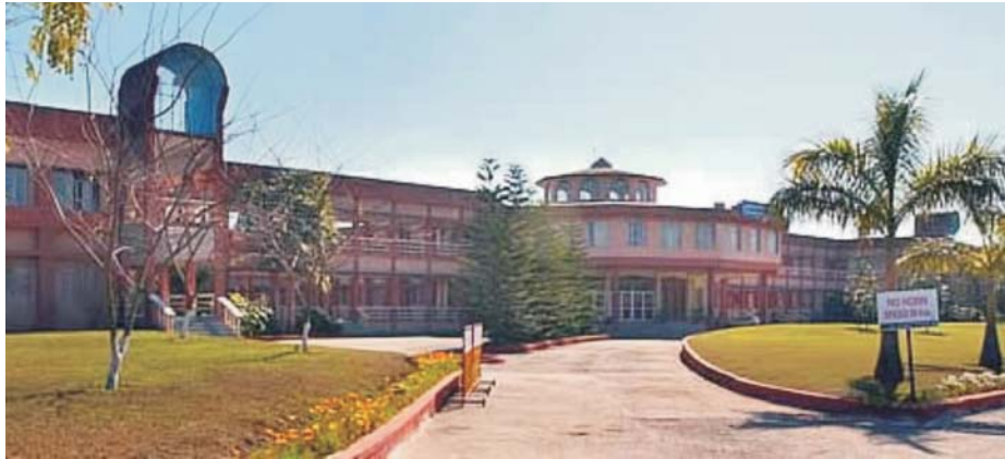
Himalayan Institute of Medical Sciences

Himalayan Institute Hospital Trust (HIHT) also has a nursing institute with annual intake capacity of 60. Just like the psychologist, none of the psychiatrists had at least two days of refresher training on the rational use of psychotropic drugs or child and adolescent mental health issues in the last year.