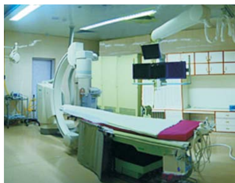
Himalayan Institute Hospital

Uttarkhand has adopted the essential drug list, which includes basic antipsychotropic medicine such as Chlorpromazine, Fluphenazine, Haloperidol (Antipsychotic), amitriptyline and clomipramine (antidepressants). However these drugs are not yet being procured by the government of Uttarkhand as there is no request made by the health facilities. 25