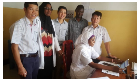
A health worker in Tanga, Tanzania shows delegates from PATH's Vietnam office and the Ministry of Health the different functions of the Tanzania Immunization Registry.

More information can be found at this link and on this website .