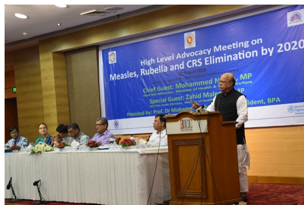
Presentation during the high-level advocacy meeting for measles-rubella free Bangladesh

Details: The Minister of Health and Family Welfare Mr Mohammed Nasim reiterated Bangladesh's strong commitment on achieving elimination of measles, rubella and congenital rubella syndrome (CRS) by 2020 in a high-level advocacy meeting jointly organized by the Department of Health Services and the Bangladesh Pediatric Association (BPA) with technical support from WHO. In line with this goal Bangladesh has developed the "Strategic Plan for Elimination of Measles, Rubella and CRS" and significant progress has been made in the implementation.