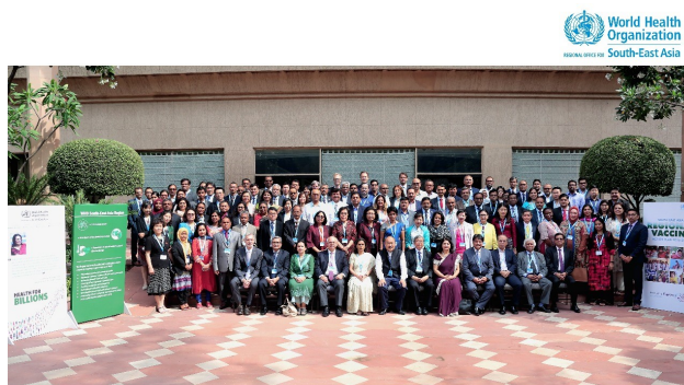
Ninth Meeting of the WHO South-East Asia Regional Immunization Technical Advisory Group 17-20 July 2018, New Delhi, India

Equally important is protecting people during public health crises; requiring high base-levels of immunization coverage, as well as a skilled workforce able to provide immunization with rapid effect. The rapid, large-scale immunization campaigns in recent months in Cox's Bazar, Bangladesh, demonstrate that a strong immunization system backed by a sizeable, well-trained health workforce can protect hundreds of thousands of people when most in need.