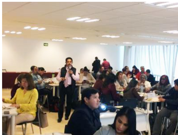
Participants at the Polio Outbreak Simulation Workshop in Mexico City, Mexico, August 2018.

The workshop was concluded successfully, and participants agreed to replicate the exercise in their States.