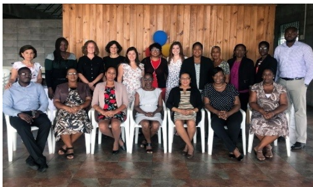
Participants from the evaluation of Grenada's IIS with DQS Plus, May-June 2018, St. George's, Grenada.

Details: The Grenada Ministry of Health (MOH) started the process of electronically recording immunization data in 2015. Using grants from the CDC and PAHO, the national EIR was introduced to help improve immunization data quality and use,