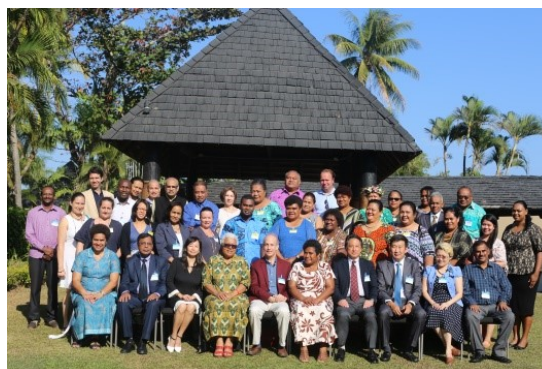
Participants at the tenth Pacific immunization programme managers meeting.

In each session, presentations were given by Secretariats (WHO/RO, WHO/DPS, UNICEF/EAPRO and UNICEF Pacific) and also country participants. The meeting allowed interactive discussions including clarifications on technical matters and practical programmatic issues in the context of the Pacific. The draft conclusions and recommendations under each session were discussed and agreed among participants at the end of the meeting. As required, partners are requested to provide their support to countries to implement agreed recommendations.