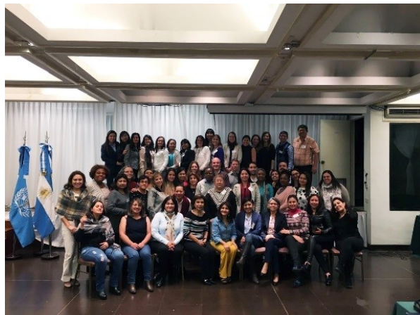
Participants from the Regional Meeting to Share Lessons Learned to Improve Immunization Rates in Urban and Peri-Urban Populations in Buenos Aires, Argentina, June 2018.

Purpose: • Share lessons learned to improve immunization rates in urban and peri-urban populations and develop strategies to improve access and use of vaccines • Review, share and document the experiences and strategies related to vaccination in urban and peri-urban populations of the Region of the Americas • Identify effective vaccination strategies targeted at disadvantaged slum populations in the Region of the Americas.