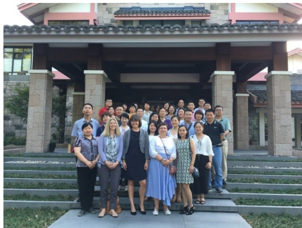
WHO facilitators and participants in the training workshop.

The participants highly appreciated this training course. Two concepts were clear: risk-based inspection will be adapted by MHRA; EU legislations require pharmacovigilance performance quality as a component for product registration and are useful to enforce pharmacovigilance in the country.