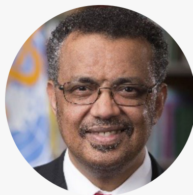
Tedros Adhanom Ghebreyesus