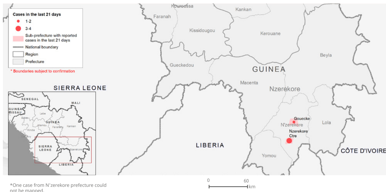
Figure 1 Distribution of EVD in Guinea by sub-prefecture as at 21 February 2021

WHO and partners are working with health authorities in Cote d'Ivoire, Guinea-Bissau, Liberia, Mali, Senegal and Sierra Leone to increase community surveillance of cases in areas that border Guinea, as well as strengthening their capacity to test alert and suspected cases and conduct surveillance in health facilities.