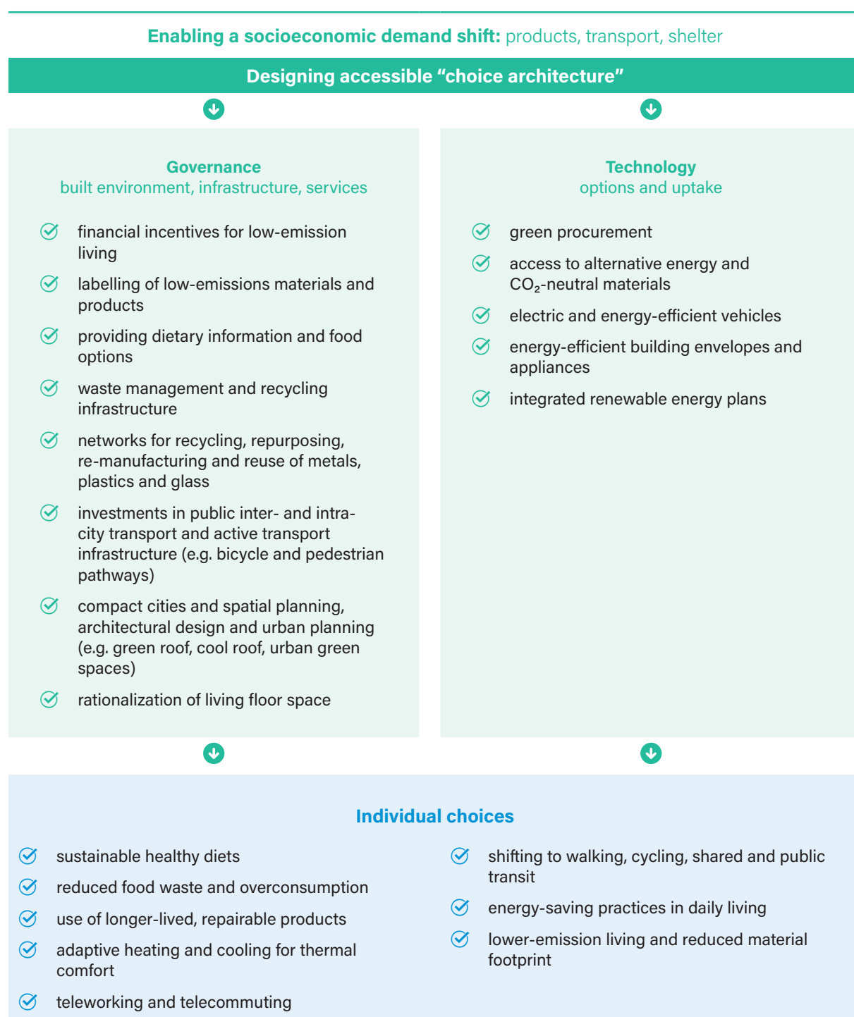
Table 3. Shifting demand for mitigation while enhancing health and well-being

Source: Climate change 2022: mitigation of climate change – summary for policymakers. Geneva: Intergovernmental Panel on Climate Change Working Group II; 2022 ( https://www.ipcc.ch/report/ar6/wg3/downloads/report/IPCC_AR6_WGIII_SPM.pdf ).