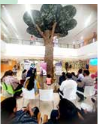
Rainbow Children's Hospital Marathalli, Bangalore

PRANAV teamed with audiologists, speech therapists of Niloufer hospital, DRS nurses, healthcare workers and St Joseph PG college students for activities related to advocacy, screening, ear and hearing care service provision, awareness raising at an event in Hyderabad. It made wide use of the materials from WHD, display posters, hand-outs, banners, flyers, and social media material. A video was made to enhance the awareness of hearing loss among the community. A girl born with hearing loss shared her success with the cochlear implant, and a speech therapist successfully demonstrated rehabilitation of cochlear implant children.