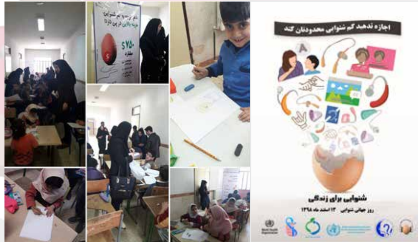
ENT and Head & Neck Research Center, Iran University of Medical Sciences