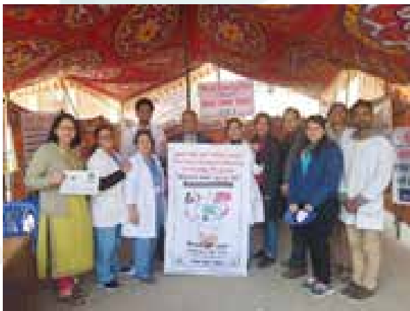
Coclear Implant Nepal Group (CING)

B.P. EYE FOUNDATION (BPEF), Hospital for Children, Eye, ENT and Rehabilitation Services (CHEERS) collaborated with Curative service division, Department of Health Services, Ministry of Health and Population to organize program at National level for the first time in Nepal. Similarly, collaborated with Bajrabarahi Community Hospital to conduct ear and hearing screening for the community people. The out-reach department of the BPEF/CHEERS also conducted a screening camp on the outskirts of Lalitpur district to celebrate the day. An inter-school quiz competition was also organized with the view to create awareness on ear and hearing health. The infant hearing screening program funded by the Embassy of Japan in Nepal, BPEF/CHEERS was also formally launched on the same day.