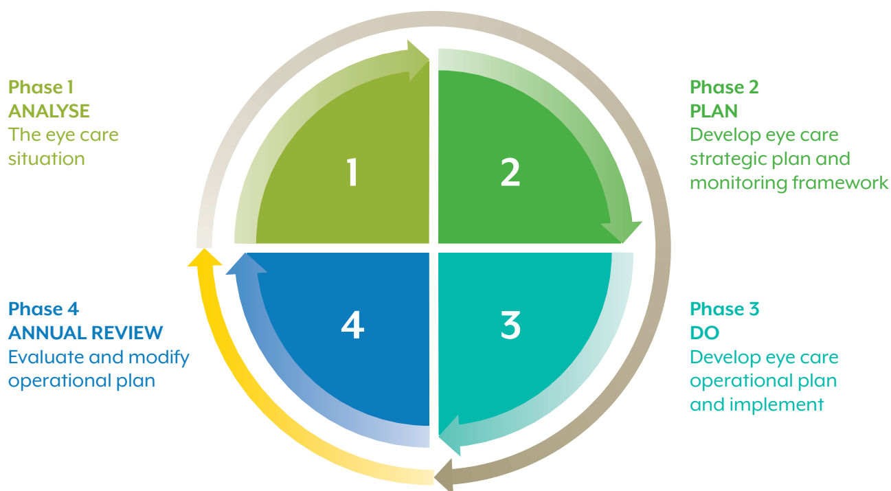
Figure 1: The four phases of the Guide

Phase 1 (Analyse) and Phase 2 (Plan) are carried out periodically, for example once every 5 years, whereas Phase 3 (Do) is ongoing and Phase 4 (Review) is carried out annually (Figure 1).